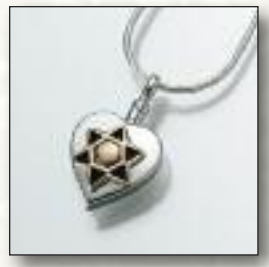
#119SK Heart w/ Star of David Inset - $350 #119SS Star of David Heart- $160 ** #119YG Star of David Heart - Call 13/16"W x 13/16"H