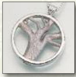
#205SS 4-chamber Tree of Lives - $270 1-1/4" Diameter x 1/4" Deep Not available in Gold Vermeil 14K Special Order - Call