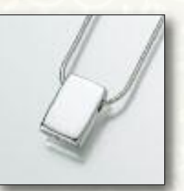
#135GV Slide Rectangle - $180 #135SS Slide Rectangle - $150 ** #135YG Slide Rectangle - Call 1/2"W x 3/4"H x 1/4"D

All items pictured not actual size. Measurements do not include the bales. All chains and leather cord sold separately. Satin cord included with all orders.