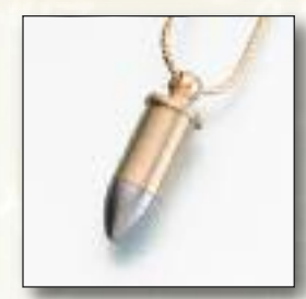
#219BR/WB Bullet - $110 7/16"W x 1-5/16"H