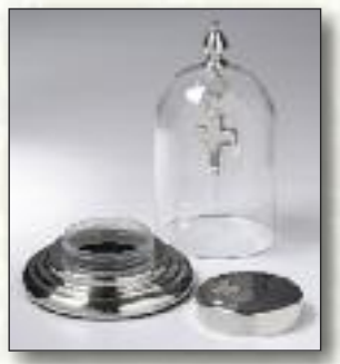
#138GV Fillable Base w/ Glass Dome Top - $150 #138PT Fillable Base w/ Glass Dome Top - $120 4" round x 6" high (Pendant sold separately)