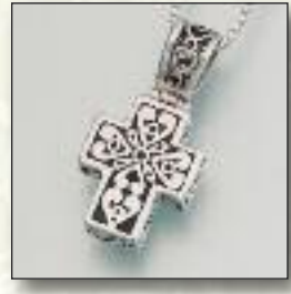
#148GV Antiqued Filigree Cross - $190 #148SS Antiqued Filigree Cross - $170 ** #148YG Antiqued Filigree Cross - Call 5/8"W x 3/4"H x 1/4"D