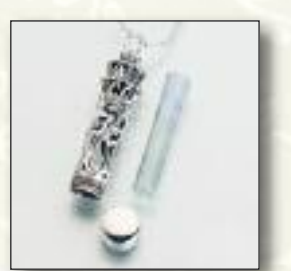
#127SS-A & #127SS-A (shown above) Removable Glass Casing w/ threaded end cap closure allows easy filling with lock of hair or other memory.