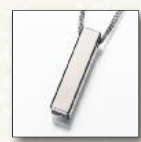
#136TT Long Narrow Sliding Rectangle - $320 5/16"W x 1-5/16"H 24" Titanium Chain Included

#168TT Necklace Pendant $400 1-1/4"L 24"Titanium Chain Included (Modified Anchor Link)