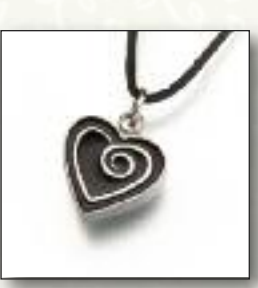
187PT-B Enameled Pewter Satin Finish Black Heart - $90 11/16"W x 11/16"H