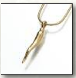
#186GV Italian Horn - $160 #186SS Italian Horn - $140 ** #186YG Italian Horn - Call 3/16"W x 1-1/8"H