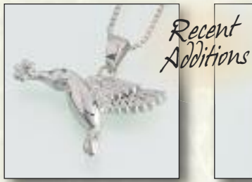
#110SS Sterling Silver Flat Hummingbird w/ Flower - $140 #110YG 14K Yellow Gold Flat Hummingbird w/ Flower - Call 1-1/4"W x 5/8"H x 1/4"D