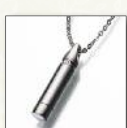
#118TT Cylinder w/ Crystal Chip - $330 5/16"W x 1-5/16"H 24" Titanium Chain Included