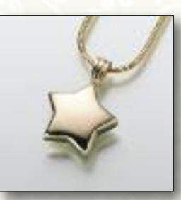
#133GV Small Star - $160 #133SS Small Star - $140 ** #133YG Small Star - Call 3/4"W x 3/4"H