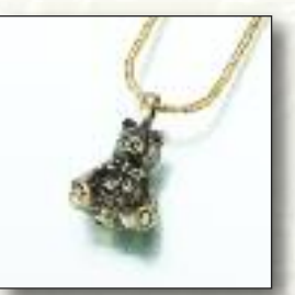
#123BR Antiqued Cherub - $90 #125BR Antiqued Teddy Bear - $90 #123WB Antiqued Cherub - $90 #125WB Antiqued Teddy Bear - $90 5/8"W x 3/4"H