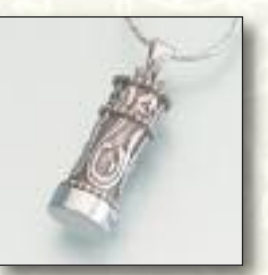
#190SS-C Small Filigree Cylinder - $180 1/2"W x 1-1/8"H