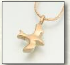
#159GV Dove - $180 #159SS Dove - $160 ** #159YG Dove - Call 5/8"W x 3/4"H