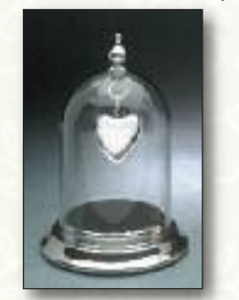
#137PT Blown Glass Dome, Pewter Base - $80 4" round x 6" high (Pendant sold separately)