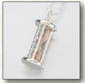
#200SS "Our" Glass - $252 1/2"W x 15/16"H