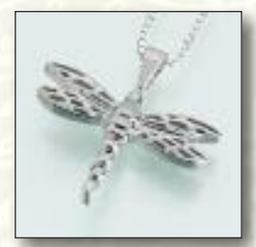
#216SS Small Dragonfly - $130 ** #216YG Small Dragonfly - Call 1"W x 11/16"H