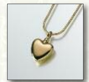
#107GV Small Heart - $180 #107SS Small Heart - $150 ** #107YG Heart - Call 11/16"W x 11/16"H