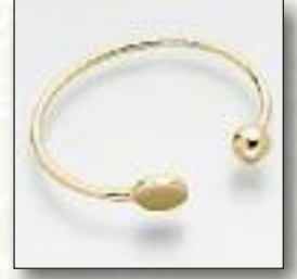
#214SS Bangle Bracelet - $280 #214YG Bangle Bracelet - Call Ball - 1/2" x 5/8"

Smaller-sized pendants can be attached to double-link bracelets. Pendants sold separately.