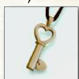
#218BR Satin Finish Key to My Heart -$110 #218WB Satin Finish Key to My Heart -$110 5/8"W x 1-1/4"H