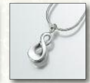
#171GV Infinity - $200 #171SS Infinity - $180 ** #171YG Infinity - Call 1/2"W x 7/8"H