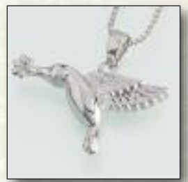
#110SS Sterling Silver Flat Hummingbird w/ Flower - $140 #110YG 14K Yellow Gold Flat Hummingbird w/ Flower - Call 1-1/4"W x 5/8"H x 1/4"D

#227SS Sterling Silver Feather - $200 #227YG 14K Yellow Gold Feather - Call 9/16"W x 1-1/2"H x 1/4"D