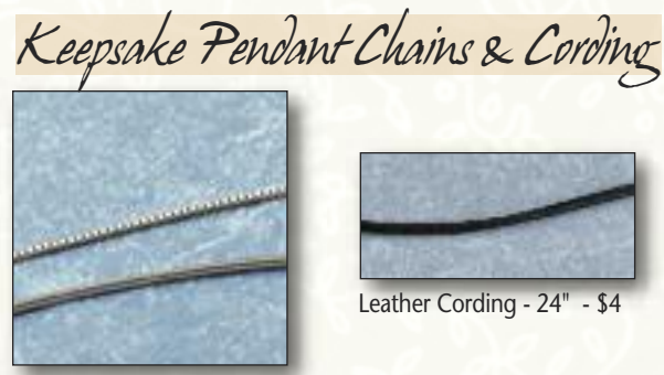
#139SS-18 Box Chain - 18" - $56 #139SS Box Chain - 24" - $70 #139GF-18 Box Chain - 18" - $72