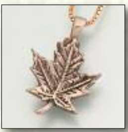
#154BR Antique Maple Leaf - $90 #154SS Maple Leaf - $150 #154GV Maple Leaf - $160 13/16"W x 1"H