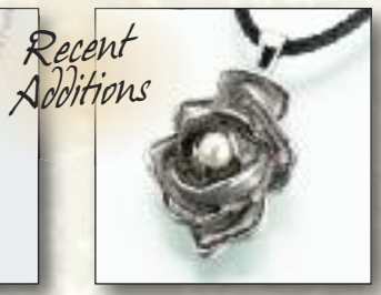
#224PT-A Antique Pewter Rose w/ Pearl - $110 #225PT Pewter Rose w/ Pearl - $110 7/8"W x 1-1/8"H x 3/8"D