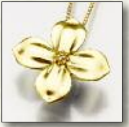
#196GV Dogwood Blossom - $190 #196SS Dogwood Blossom - $170 ** #196YG Dogwood Blossom - Call 1-1/4"W x 1-1/"H x 3/8"D