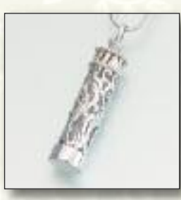
#127SS-C Glass Cylinder/ Filigree Casing - $170 ** #127WG Glass Cylinder/ Filigree Casing - Call 1/2" x 1-7/8"H