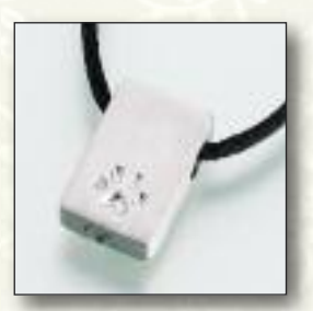
#229SS Sterling Silver Rectangle Pendant w/ Paw Print - $160 #229YG 14K Yellow Gold Rectangle Pendant w/ Paw Print - Call 1/2"W x 3/4"H x 1/4"D