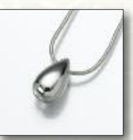
#121GV Slide Tear Drop - $180 #121SS Slide Tear Drop - $160 ** #121YG Slide Tear Drop - Call 7/16"W x 7/8"H