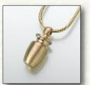
#115 Brass Small Urn - $90 #115SS Small Urn - $150 ** #115YG Small Urn - Call 7/16"W x 11/16"H