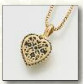
#158GV Filigree Heart - $180 #158SS Filigree Heart - $170 #158YG Filigree Heart - Call 5/8"W x5/8"H