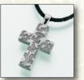
#222PT-A Pewter Cross w/ Antique Filigree - $110 #223PT Pewter Cross w/ Filigree - $110 3/4"W x 11/16"H x 3/16"D