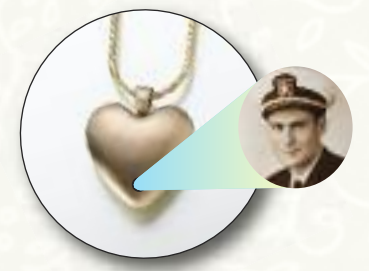
#150BR Heart w/ Lens - $350 15/16"W x 15/16"H