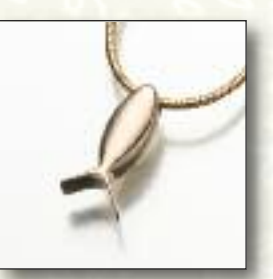
#183GV Fish (Ichthus) - $150 #183SS Fish (Ichthus) - $130 ** #183YG Fish (Ichthus) - Call 3/8"W x 3/4"H

All items pictured not actual size. Measurements do not include the bales. All chains and cording sold separately.