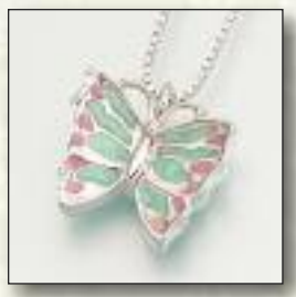
#129SS Butterfly - $220 13/16"W x 11/16"H