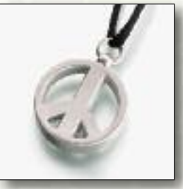
#201PT Peace Sign - $90 15/16"W x 15/16"H