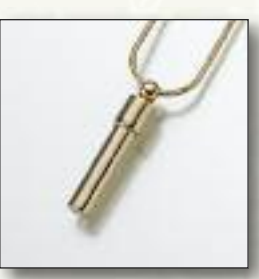
#117BR Cylinder - $90 #117SS Cylinder - $170 ** #117YG Cylinder - Call 1/4"W x 1-1/4"H Double Chamber Option Available

All items pictured not actual size. Measurements do not include the bales. All chains and leather cord sold separately. Satin cord included with all orders.