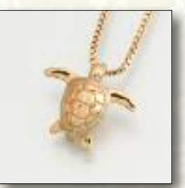
#157GV Turtle - $180 #157SS Turtle - $160 ** #157YG Turtle - Call 3/4"W x 3/4"H