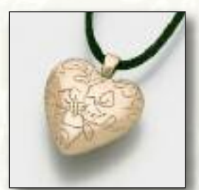
#149BR Floral Heart - $110 15/16"W x 15/16"H