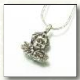
13/16"W x 3/4"H