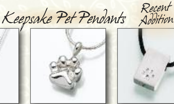
#166GV Paw - $160 #166SS Paw - $140 ** #166YG Paw - Call 5/8"W x 5/8"H