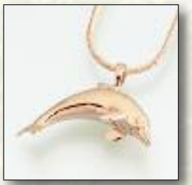
#162GV Dolphin - $190 #162SS Dolphin - $170 **#162YG Dolphin - Call 1-1/8"W x 1/2"H