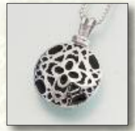
#160SS Filigree Round - $220 ** #160YG Filigree Round - Call 7/8"W x 7/8"H