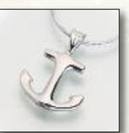
#217SS Anchor - $180 ** #217YG Anchor - Call 13/16"W x 3/4"H