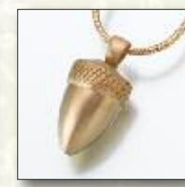
#155BR Acorn - $90 #155SS Acorn - $150 #155GV Acorn - $170 1/2"W x 3/4"H