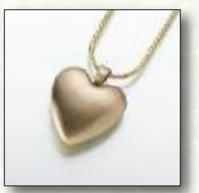
#111BR Satin Finish Heart - $90 15/16"W x 15/16"H