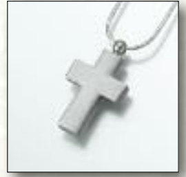
7/8"W x 1-1/4"H