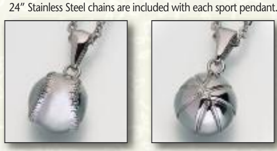
#208ST Baseball w/chain - $170 1/2"W x 1/2"H