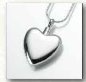
#106GV Large Heart - $230 #106SS Large Heart - $210 **106YG Large Heart - Special Order 1-5/16"W x 1-5/16"H