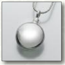
#116SS Large Round - $210 **116YG Large Round - Special Order 1-1/8"W x 1-1/8"H x 1/2"D