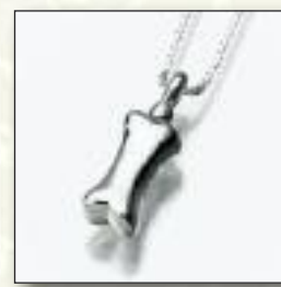
#165GV Dog Bone - $150 #165SS Dog Bone - $130 ** #165YG Dog Bone - Call 3/8"W x 3/4"H