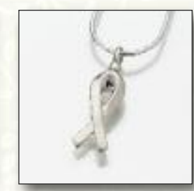
#195GV Remembrance Ribbon - $170 #195SS Remembrance Ribbon - $150 ** #195YG Remembrance Ribbon - Call 7/16"W x 1"H x 3/16" D