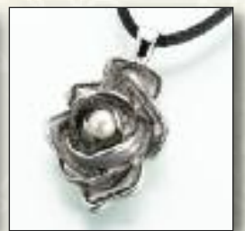
#224PT-A Antique Pewter Rose w/ Pearl - $110 #225PT Pewter Rose w/ Pearl - $110 7/8"W x 1-1/8"H x 3/8"D