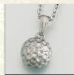
#210ST Golf Ball w/chain - $170 1/2"W x 1/2 "H