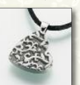
#220PT-A Pewter Heart w/ Antique Filigree - $110 #220PT Pewter Heart w/ Filigree - $110 3/4"W x 3/8"H x 3/16"D