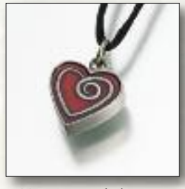
187PT Enameled Pewter Satin Finish Red Heart - $90 11/16"W x 11/16"H