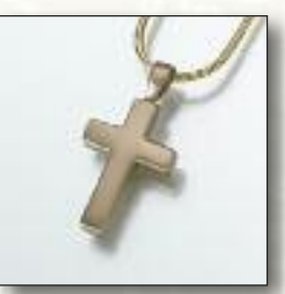
#112PT Satin Finish Cross - $90 #114 Brass Satin Finish Cross - $90 5/8"W x 1"H