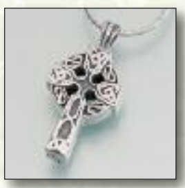
#203GV Celtic Cross - $220 #203SS Celtic Cross - $190 #203YG Celtic Cross - Call 3/4"W x 1-3/16"H x 1/4" Deep