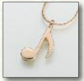
#202GV Music Note - $200 #202SS Music Note - $192 **#202YG Music Note - Call 3/16"W x 1-3/8"H