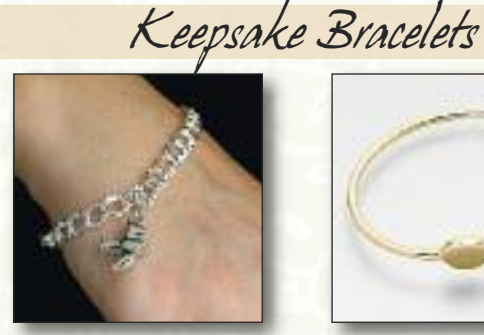
#164SS-B Double Link Bracelet w/jump ring - $60 7mm links, 7" long (jump rings should be soldered)

Hand-crafted lens magnifies image 160 times