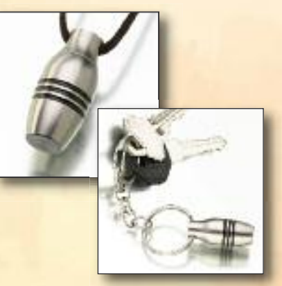
#193ST Urn Pendant w/ Key Chain and 35"L suede leather cording - $150 9/16"W x 1-13/16"H

Sliding double screwed back panel for easy filling. Beveled edge on sides of pendant.